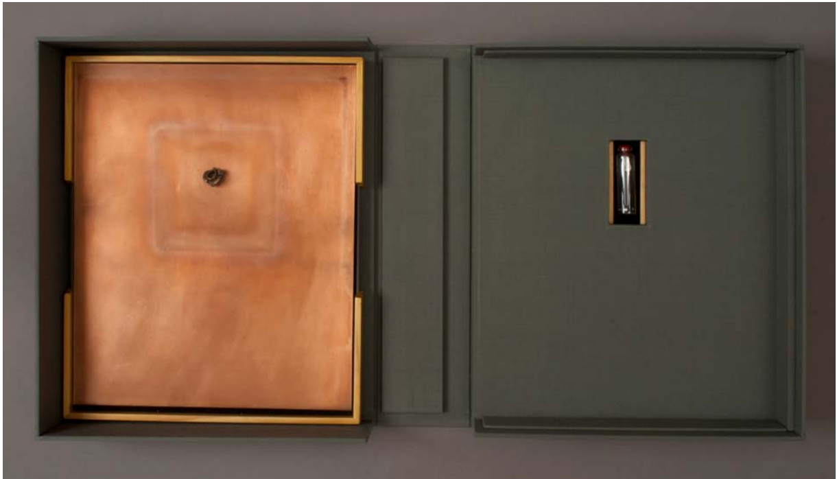
Left: Spent Bullet and right: Indeterminacy from BRADSHAW , 2003

BRADSHAW, Limited Edition Box ultimately complicates the dichotomies of nature versus culture and unique object versus multiple, all while challenging classic notions of possession and distribution. Like the wild birds flying between the bicycle wheel and the archer's target, Bradshaw's work is alive, even when contained in a closed box.