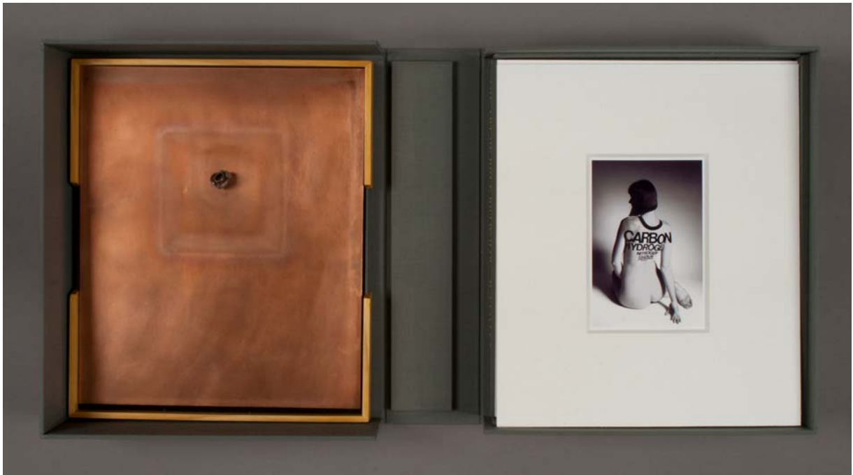
Left: Spent Bullet and right: Herself in the Element from BRADSHAW, 2003

Plain Air (1969-1991) is perhaps the most straightforward exploration of this paradox. This archival silver gelatin print captures the installation Bradshaw created by unleashing two mated pairs of birds in a room with a bicycle wheel hung from the ceiling and a Zen archer's target nailed to the floor, recalling Dada and Neo-Dada emblems. In their dynamic movements among these symbols of human achievement, the birds perform, most literally, the oscillation between the poles of nature and culture. A similar flux can be observed in another photograph, Herself in the Element (2002), which presents a nude with her back to the viewer, calling to mind Man Ray's Le Violin d'Ingres (1924). In place of Man Ray's F-holes, however, painted on the woman's back are the names of the chemical elements that compose the human body, in descending order by weight. The O around the woman's neck denotes oxygen, followed by carbon, hydrogen, and so on, with the words becoming progressively smaller until they appear illegible (at this scale). The image of the woman's back, which can be seen both to represent the unknowable ground of nature and to reference the Dada master's photograph, is layered with another ambiguous nature/culture oscillation: the linguistic representation of the biological elements that constitute a human being.