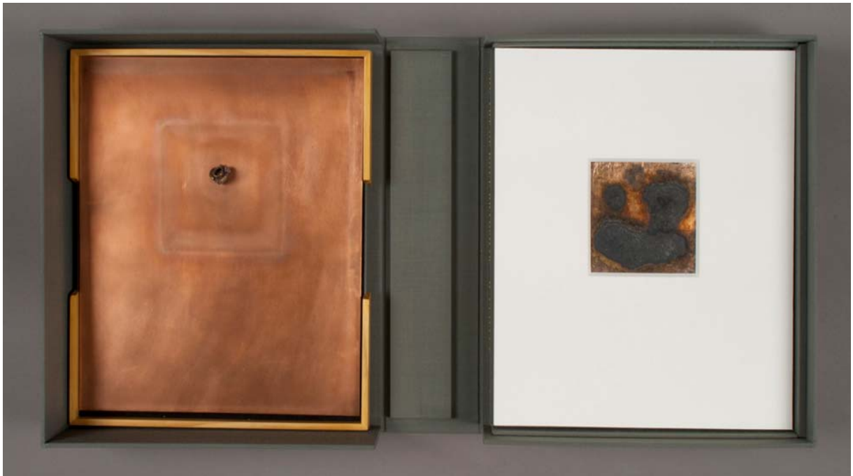
Left: Spent Bullet and right: Contingency Pour from BRADSHAW, 2003

In Spent Bullet (1969/2003), a copper-encased lead bullet that was shot is soldered onto a copper sheet, suggesting metaphors of natural beauty rather than of man-made destruction. It is a rare example of the artist's political work, the utopian desire for spent bullets to be retired as works of art or worn as jewelry. Contingency Pour (1984/2002), a study in the reaction of silver to liver of sulfur, is complicated and unpredictable; this work clearly identifies change. However, Contingency Pour is still encased in mat board, which protects the other works in the box from the volatile chemical, again leading us to consider how the box's individual pieces are contained and displayed. Indeterminacy (1993) consists of seven drops of mercury floating in a glass vial sealed with wax. It is indeterminate in the sense that the mercury is not fixed, although a tiny tag affixed to the bottle, reminiscent of Lewis Carroll's Alice in Wonderland , warns the viewer not to touch, ingest, or inhale, thus sealing and cordoning off what is naturally hazardous.